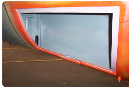
TufSeal™ HT3000 on access panel