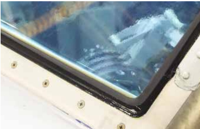
Thixflex Black® injected around cock pit windows