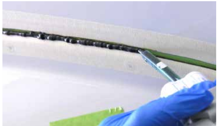
Thixflex Black® installed in panel to create water tight seal