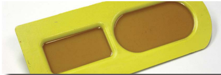
TufStuff™ applied to Cargo Fitting.